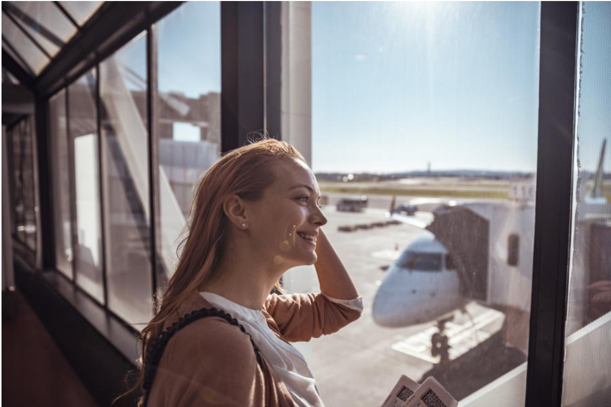
Close up of a young woman waiting to board the airplane at the airport