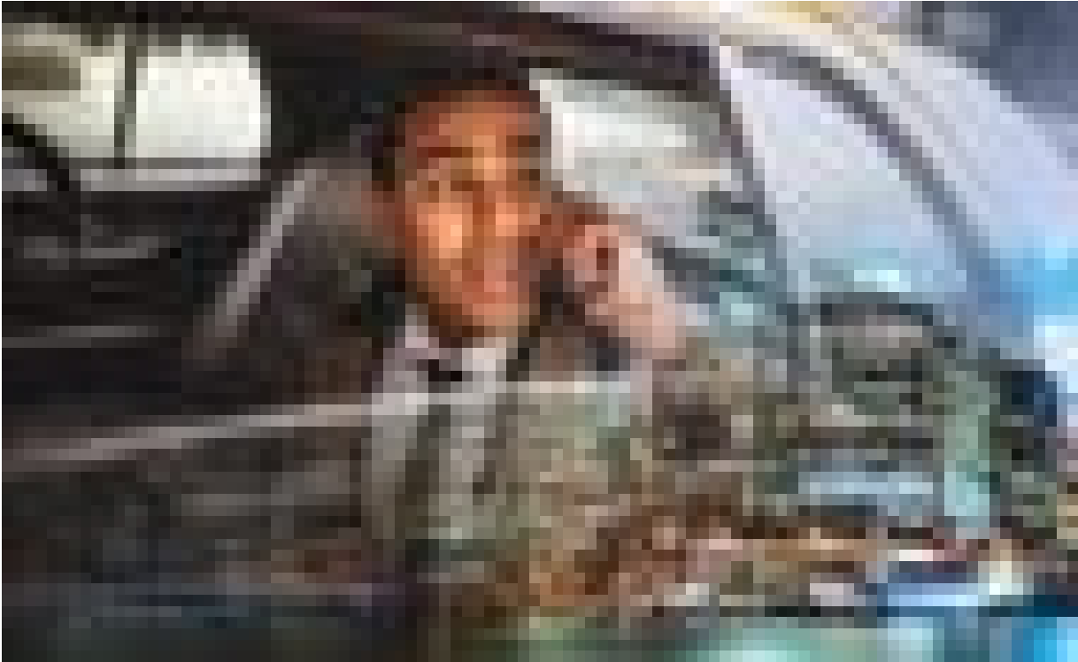
Businessman in an uber, excited to be in New York City

To capitalize on this new and exciting trend, Blueground, a proptech company, is reinventing the way people live and work with its new program —Blueground Nomads. The startup offers around 4,000 fully furnished apartments in 15 cities around the world. You could sign up for an